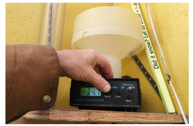
A readout of Tower's Wednesday low.