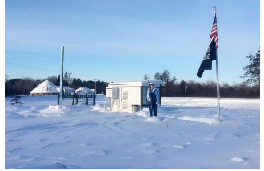
Outside a welcome center in Embarrass, Minn., a box on stilts houses thermometers.

Embarrass, Minn., hoped to win the state low-temperature crown, which it argues unjustly went to a neighbor in 1996 when the official thermometer broke