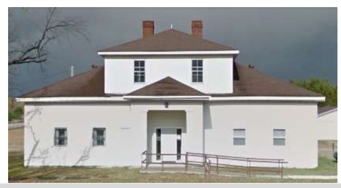
Waasa Township Regular Board Meeting Wednesday, February 3, 2021, 7:00 p.m.